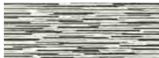
DBFS RT-ALTAI-NAT GREY 32X89