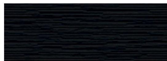
DBFX RT-ALTAI-NAT BLACK 32X89